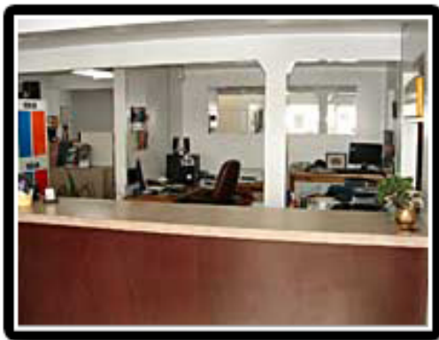
Front Reception Desk