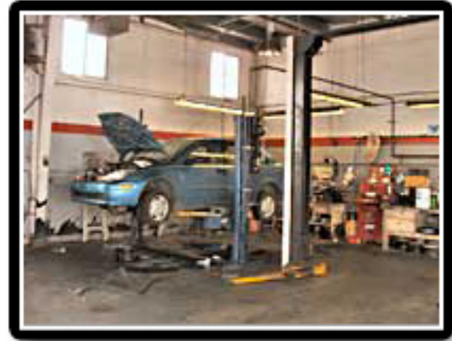
Car on Hoist