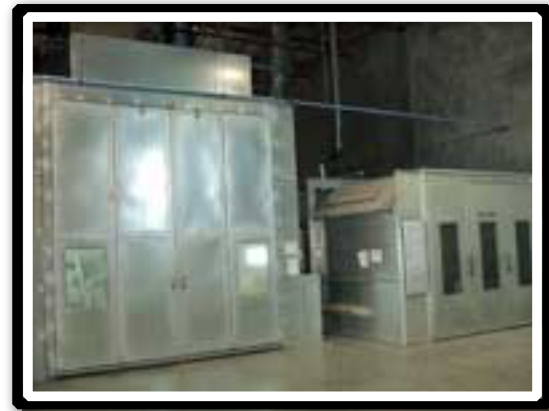
Spray Booth and Bake Oven