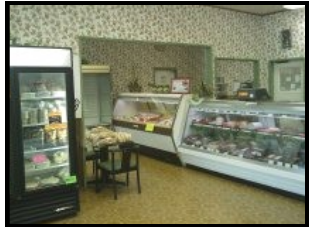
Front of Deli