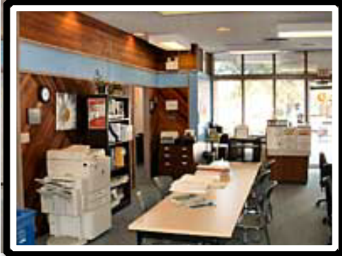
Central Work Area